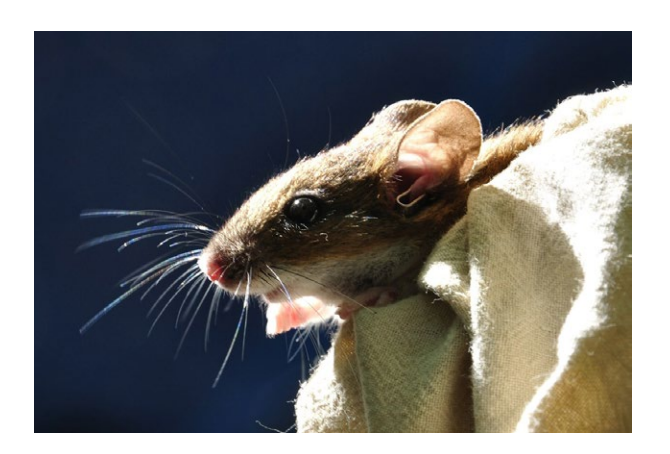
FIGURE 1 Yellow-necked mouse ( Apodemus flavicollis ) is a granivorous woodland rodent common in Europe

In this work, we used SECR models to evaluate whether the relationship between population density and small mammals' space use differs at two distinct phases of the rodent population cycle: postmast peak in abundance (first summer after masting; hereafter FSA) and subsequent crash (second summer after masting; SSA). We used yellow-necked mouse ( Apodemus flavicollis ; Figure 1) population as a model system. The fluctuations of the studied population are induced by beech ( Fagus sylvatica ) mast seeding (Zwolak, Bogdziewicz, & Rychlik, 2016), that is, the intermittent and synchronized production